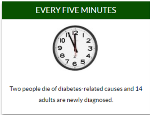
Figure 1: CDC – Chronic Disease Prevention & Health Promotion

Rising diabetes rates are a primary driver of Maryland’s rising health care costs. In 2012, diabetes alone cost families and the US economy more than $245 billion 1 – taking into account both direct costs (e.g., health care services and prescriptions) and indirect costs (e.g., absenteeism, lost productivity, etc.). MedChi, The Maryland State Medical Society, which represents more than 8,000 Maryland physicians and their patients, commissioned this study to estimate both the extent of diabetes in Maryland Medicaid enrollees and the likely financial impact of this largely preventable disease on taxpayers. MedChi is concerned that increasing rates of diabetes and pre-diabetes among our state’s youngest generations will place an undue